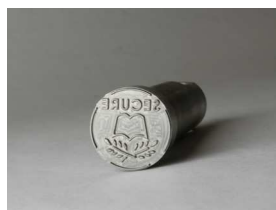
.5 in. (12.7 mm) Education Design