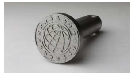
Example of a generic tactile impression die.

The tactile impressor feature, designed exclusively for use in the Datacard® SD460™ card printer and CD800™ card printer with inline lamination module, offers an affordable and entry-level security feature ideal for any card program. This patent-pending feature utilizes a mechanical die within the laminator that physically impresses a generic or custom design directly onto the card substrate and overlay or patch laminate in the same pass. The final output is a card with added counterfeiting and tampering resistance that will impress any cardholder.