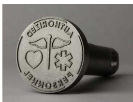
.9 in. (22.86 mm) Medical Design