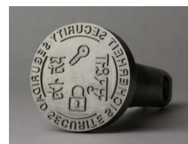
.9 in. (22.86 mm) Security Design