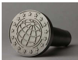
.9 in. (22.86 mm) Global Design