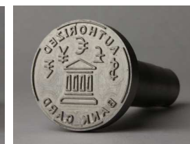
.9 in. (22.86 mm) Bank Design